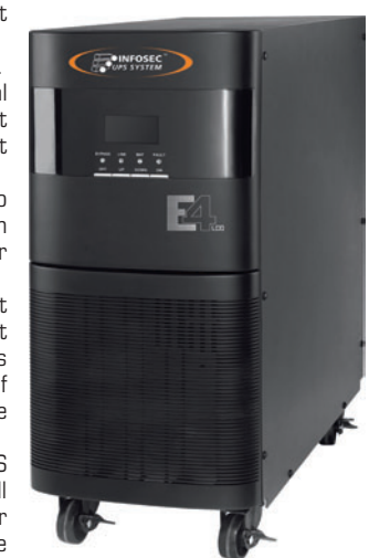
E4 LCD 5-6-10 kVA