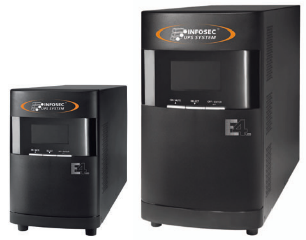
E4 LCD 1-1,5 kVA

Automatic control of loads, power supply and UPS internal operation for greater reliability.