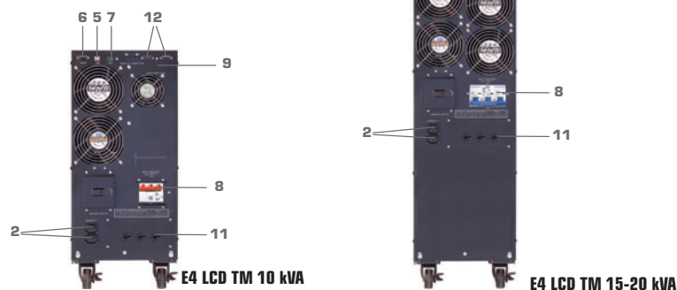
E4 LCD (S) TM 10k E4 LCD (S) TM 15k E4 LCD (S) TM 20k