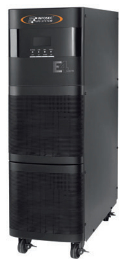
E4 LCD TM 15-20 kVA

E4 LCD (S)TM UPSs , available in 10, 15 & 20 kVA models (up to 60 kVA in parallel), are supplied with a three-phase input voltage (three phase/single phase UPSs). • E4 LCD TM UPSs have their own built-in batteries for standard backup time. • The E4 LCD STM models are delivered without an internal battery but with external battery packs. These battery extensions are available in several sizes depending on the desired backup time.